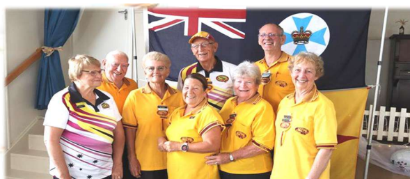
MEMBERS WITH FEBRUARY BIRTHDAYS